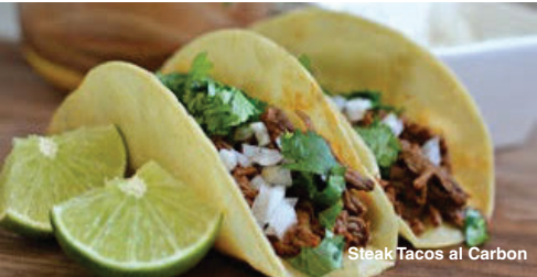
Steak Tacos al Carbon

3 soft flour tortillas filled with breaded fried tilapia, crispy lettuce, shredded cheese, and pico de gallo.