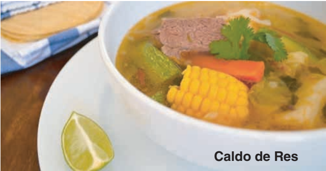
Caldo de Res

15% gratuity will be added for parties of 6 or more. Additional charges may apply for extra chips and salsa when not ordering an entree