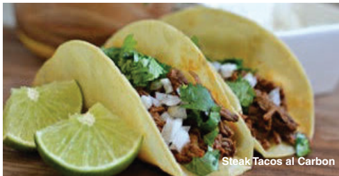
Steak Tacos al Carbon

3 soft flour tortillas filled with breaded fried tilapia, crispy lettuce, shredded cheese, and pico de gallo.